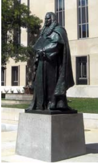
Statue of Sir William Blackstone, Washington, DC.