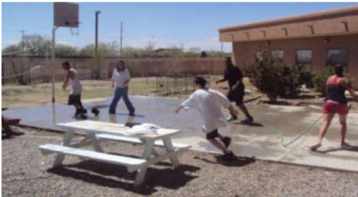
Project New Day students engage in a water fight at a Safe Home in Albuquerque

Chief among these charitable causes is Blackstone's support for Project New Day Youth & Family Services, a nonprofit social services organization that helps troubled youths and their families put together a plan to become productive, contributing members of their communities.