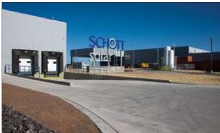
SCHOTT Solar's facility in Albuquerque represents an initial investment of more than $100 million.

The Southwest Region is rapidly becoming a Mecca for international solar manufacturing corporations seeking to expand into the United States, a trend that has been anticipated by Blackstone since it was founded. "The American Southwestern desert is the