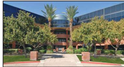
Blackstone's new headquarters

Phoenix, Ariz. – Blackstone Security Services is on the move in more ways than one or two or three, or four or five – the number of major recognitions Blackstone has received during the past two years. The recognitions won