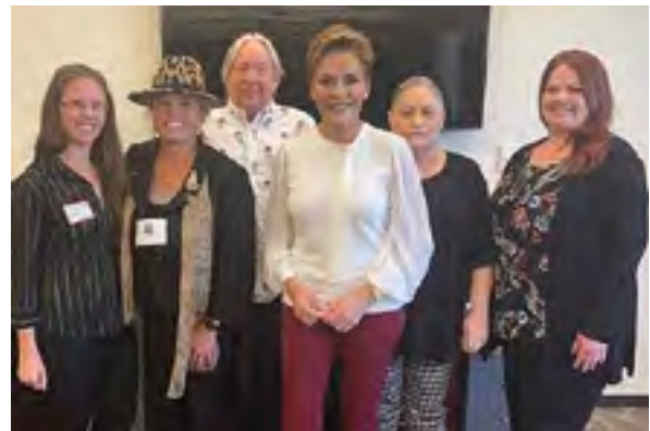
Kari Lake with team Blackstone at the monthly APSPA meeting.

Lake is well known for being a reporter, news anchor and TV personality for over the last 27 years. She impressed many people when Lake, being a person of such high stature, left her career, at the top of her profession, over principals. Lake is a common sense conservative who walked away from the media as a