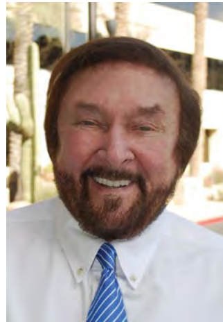
Rep. Jay Lawrence

strumental in APSPA's successful 2017 legislative campaign to require security guard trainers to undergo the same background checks as the guards they train. Their efforts resulted in the passage of HB 2319, eventually signed into law by Gov. Doug Ducey.