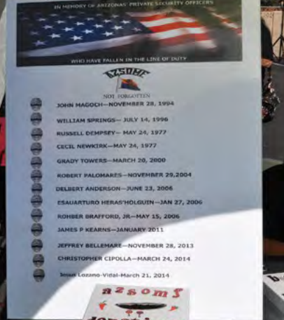
“Not Forgotten” Arizona Security Officer Memorial Board